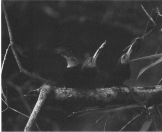
FIG. 1. Three adult White-throated Jacamars waiting to deliver food items to nestlings at Cocha Cashu, Manu National Park, Peru, 27 August 2001.

previously undescribed) song. This was quite low in volume and weak in tone, beginning with a brief rising twitter, which abruptly decelerated and developed into a descending series of more evenly pitched, emphatic, plaintive notes (Fig. 2b). This general format is similar to the songs, or parts of songs, of other jacamar species in the genera Brachygalba and Galbula (although members of the latter genus are larger with stronger and richer voices). All White-throated Jacamars seemed rather unresponsive to tape playback, sometimes answering calls or songs but rarely, if ever, approaching.